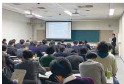
▲Scenes from the luncheon seminars at 2019 Spring Meeting.