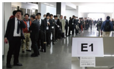
▶Long line before the seminar starts