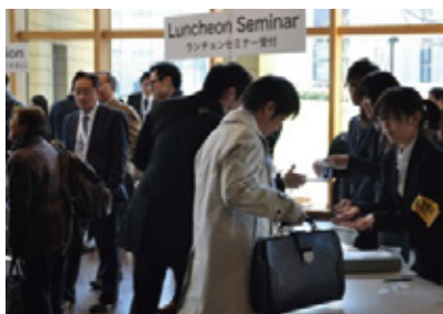
▶Participants receive seminar tickets at Registration.