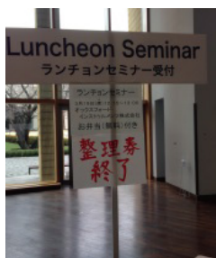
▶All luncheon seminars were full house at the 2014 Spring Meeting.