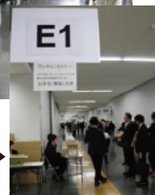
▶Tables and chairs provided in front of the room