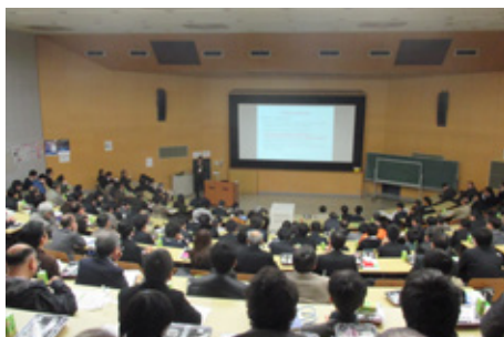
Scenes from the luncheon seminars at 2015 Spring Meeting